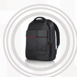
ThinkPad Professional Backpack