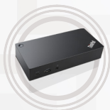
ThinkPad Thunderbolt 3 Dock