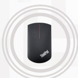
ThinkPad Precision Wireless Mouse